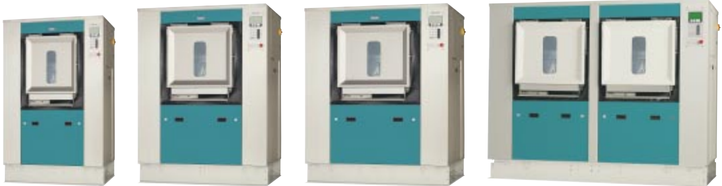
WS6 230H: 55 lb. cap. 350 G-Force

Designed and built for the 21st Century!